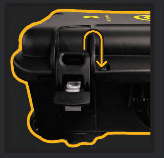
1. Open the case by squeezing down the latch and lifting up.