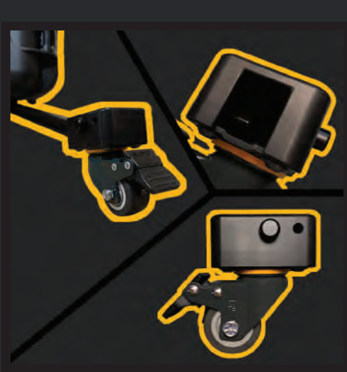
10. Connect the wheels to the stabilizing legs. Push the wheel into the end of the sta- bilizing leg by pressing the button on the side of the wheel. Release the button and lock the wheels on the stabilizing leg.

Your Wireless AP should light up as soon as the two ends of the ethernet cables are plugged in securely.